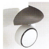
Wheel with brake

Zimmer Elektromedizin GmbH Junkersstraße 9 D-89231 Neu-Ulm Tel. +49. (0)7 31. 97 61-291 Fax +49. (0)7 31. 97 61-299 export@zimmer.de www.zimmer.de