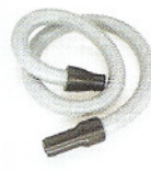
Standard treatment hose